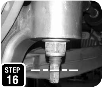
EXAMPLE OF TRIM

then trim the excess of the lower ball joint right at the jam nut so that there is clearance between the ball joint and the rim. This may be necessary for some 20" rims also.