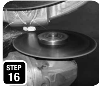
LOWER BALL JOINT