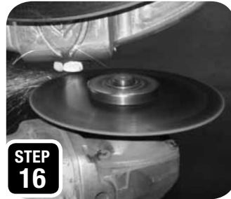
LOWER BALL JOINT