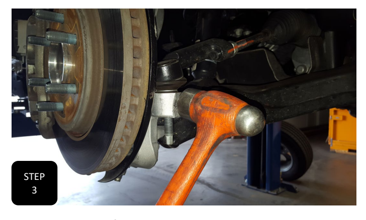
Step 3 Unbolt the tie rod from the spindle and break it loose by hitting the side of the spindle, right at the tie rod, with a hammer. NOTE: NEVER HIT THE TIE ROD ON THE THREADS.