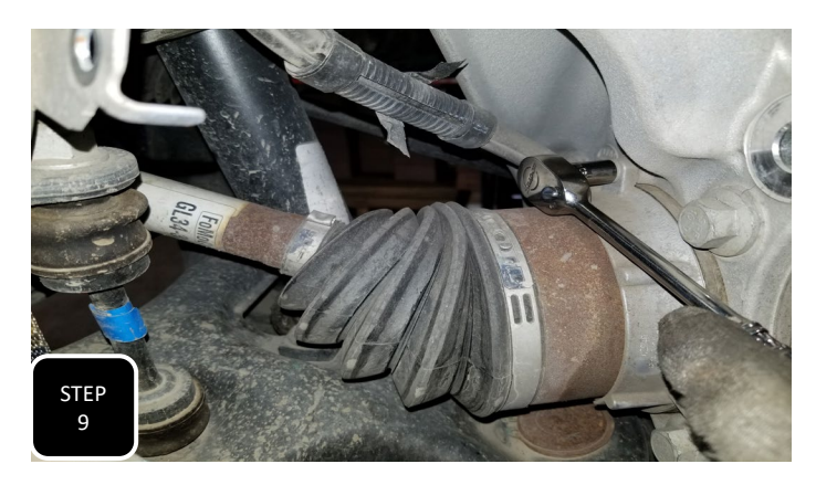
Step 9 For 4wd models, you will also need to remove the 3 hub actuator bolts on the back side of the spindle.