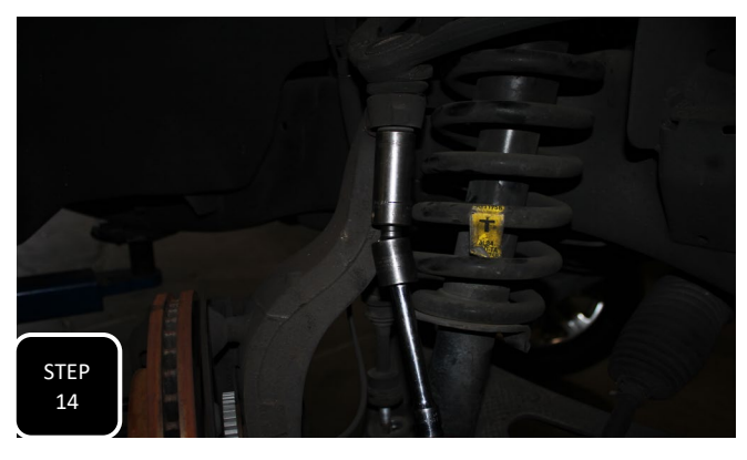
Step 14 Support the spindle so that the brake line does not get stretched out while installing the lower strut bolt. Next, place a floor jack under the lower control arm and jack it up to compress the coil so that you can re-attach the upper control arm to the spindle and tighten.