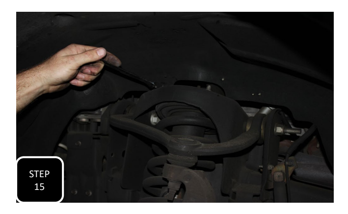
Step 15 Re-attach the tie rod and tighten. Then tighten the 3 nuts at the top of the strut. NOTE: DO NOT TIGHTEN THE LOWER STRUT BOLT UNTIL THE TRUCK IS ONN THE GROUND AT RIDE HEIGHT.