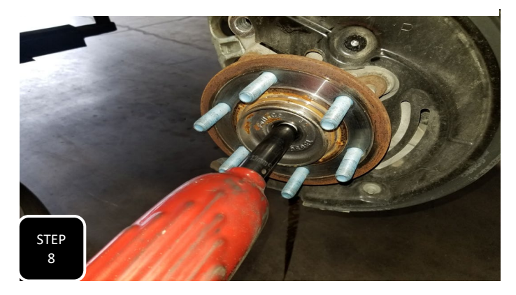
Step 8 For 4wd models, you will need to remove the dust cap at the middle of the wheel bearing and then remove the axle retainer nut.