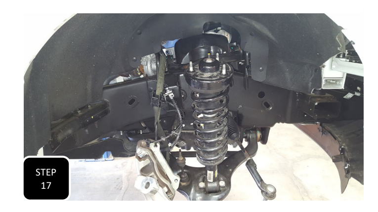
Step 17 Push down on the lower control arm with your knee or a pry bar while also lifting up on the upper control arm so that the studs on the top of the strut clear the tower. NOTE: THIS WILL BE TOUGHER THAN THE REMOVAL BECAUSE THE STRUT IS NOW LONGER.