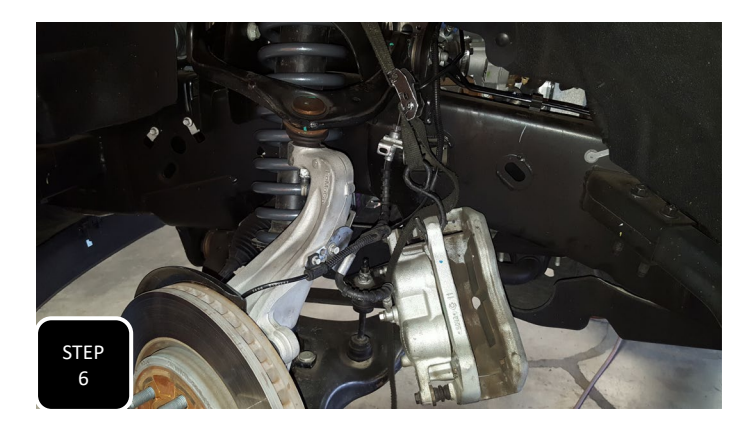
Step 6 Unbolt the brake caliper from the spindle and support it out of the way. NOTE: NEVER ALLOW THE CALIPER TO HANG BY THE BRAKE LINE.