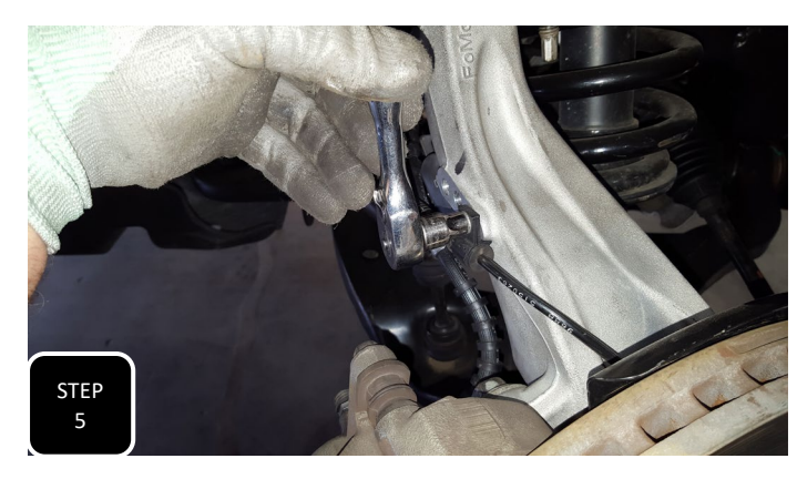
Step 5 For newer models the whole spindle will need to come off to safely install the spacers so start by unbolting both the Brake line and ABS line from the neck of the spindle and separate.