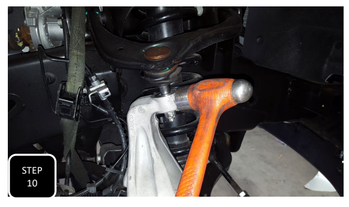
Step 10 All models, unbolt both the upper and lower ball joints, but do not remove the nuts. Hit the side of the spindle, right at each ball joint, with a hammer to break them loose. The nuts will catch the spindle. Then remove the nuts and the spindle.