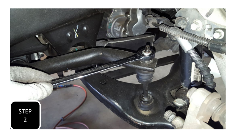
Step 2 Unbolt the sway bar end link from the sway bar.