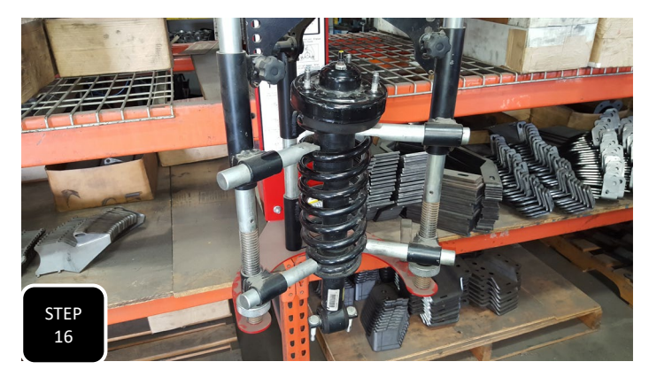
Step 16 Because the strut spacer has a rotated bolt pattern, you will now need to compress the coil and rotate the bottom of the shock 180 degrees so that the angled bar pin is once again angled inward.