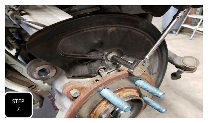
Step 7 Unbolt the ABS sensor and position it out of the way. The top bolt of the dust shield will need to be removed for the ABS wire to clear and the sensor to be separated from the spindle.