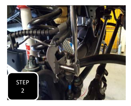
Step 2 Un-bolt the brake line bracket from under the coil seat on both sides and separate.

Step 1 Jack up the front of the vehicle and support under the frame rails with jack stands. Keep an adjustable jack under the axle for height adjustment.