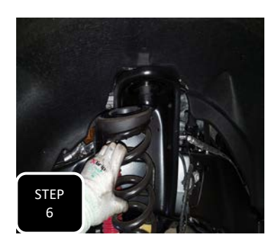
Step 6 Lower the axle down and remove the coil with the rubber isolator.

THREAD LOCKER TO THE THREADS OF THE BOLT.