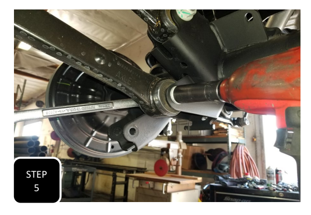
Step 5 Unbolt the trac bar from the mount on the frame and separate. Next, loosen all 8 bolts attaching all 4 control arms just enough to take tension off of the bushings.