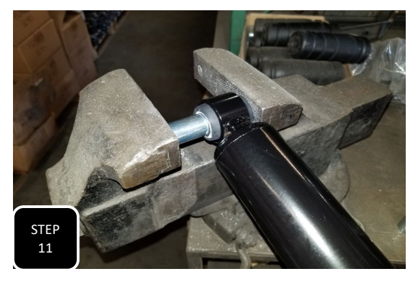
Step 11 Locate the new Max Trac shocks and hardware. Lube up the lower shock bushings with a suitable grease and press the sleeves in using a vise. NOTE: IT HELPS TO TWIST THE SHOCK UP AND DOWN WHILE PRESSING THE SLEEVE IN. Skip to the next step if installing Fox shocks.