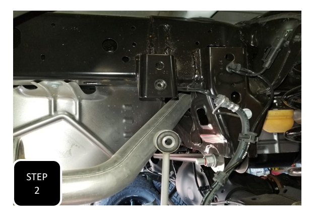
Step 2 Unbolt the sway bar end link from the frame on both sides and separate.