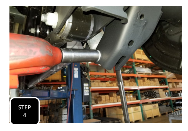
Step 4 Unbolt both rear shocks at both ends and remove them.