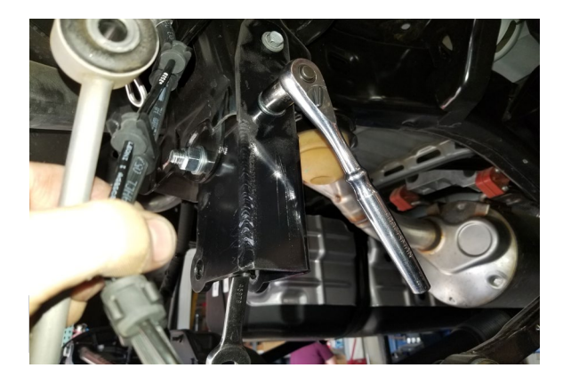
Step 9 Install the provided 7/16-14 \times 1 \frac{1}{4} " bolt, washers, and nut in the lower slotted hole on the side of new trac bar bracket and then tighten all 3 mounting bolts.