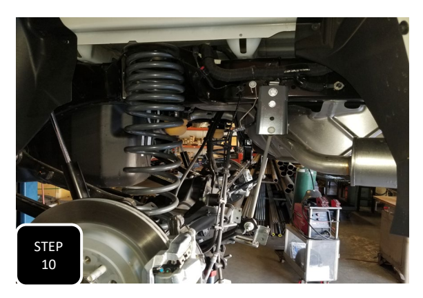
Step 10 Lower down the axle, remove the stock coils and then install the new 4" lift coils. Make sure to transfer over any and all rubber isolators. NOTE: BE CAUTIOUS NOT TO OVER EXTEND ANY LINES, WIRES, OR HOSES.