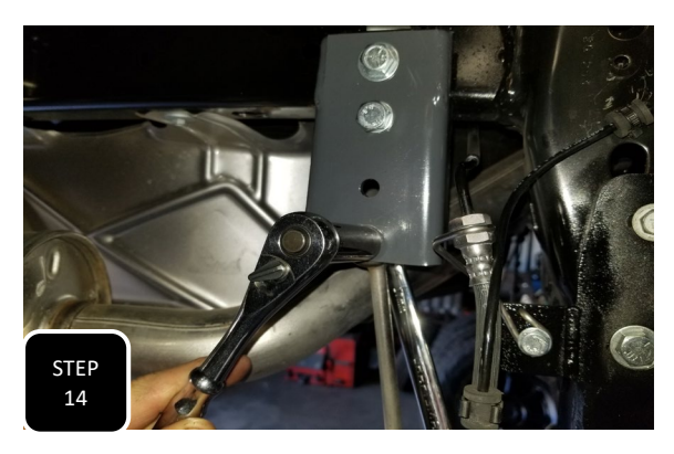
Step 14 Align the sway bar end link inside of the new bracket and attach it using the factory M10 bolt and the provided M10 nut and washer then tighten.