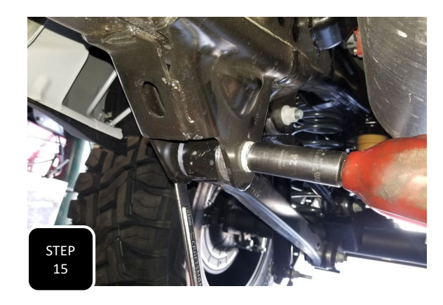
Step 15 Install the new wheels and tires then lower the truck back to the ground. Jump on the rear bumper a few times to settle the suspension then tighten the trac bar bolt and all 8 control arm bolts. NOTE: THE TRUCK MUST BE AT RIDE HEIGHT WHEN TIGHTENING UP THESE BUSHINGS TO AVOID PREMATURE WEAR.