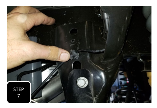
Step 7 Unbolt the brake line bracket at the frame on both sides so that the brake lines do not get over extended when installing the new coils. Next, pull the ABS line mounting clip from the side of the factory trac bar bracket and install it one hole down.