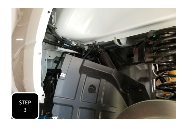
Step 3 Unbolt all of the plastic wheel well mounting bolts on both sides and remove the plastic wheel well. This will allow access to the top of the shock.