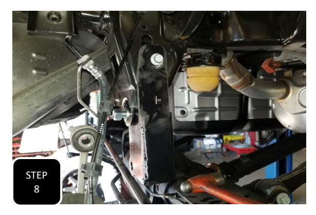
Step 8 Locate the new trac bar bracket and loosely install it using the provided M14-2.0 x 80 bolt & crush tube through the factory bolt hole and the factory brake line mounting bolt on the side. The bracket needs to be off-set towards the front of the truck with one ear on the outside of the original bracket and one ear on the inside.