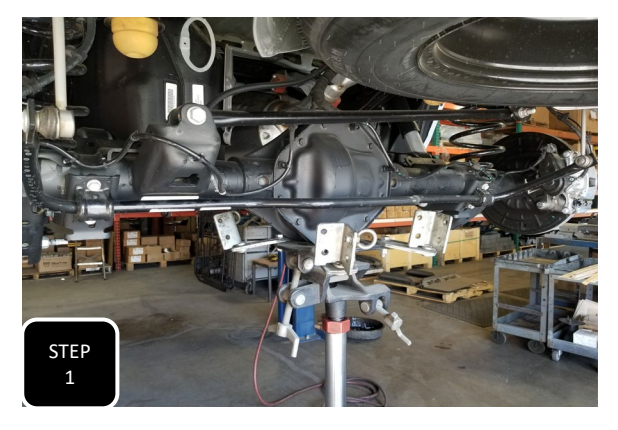
Step 1 Jack up the rear of the of the vehicle and support under the frame rails with jack stands. Remove both tires and keep an adjustable jack under the diff for height adjustment.