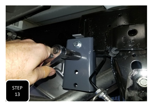
Step 13 Loosely attach the new sway bar drop down brackets to the mount on the frame using the provided M10-1.5 x 35 bolt and washer into the factory threaded hole. Next, line up the provided nut plate with the upper mounting hole and attach it using the provided 7/16-14 \times 1 " bolt and washer then tighten both.