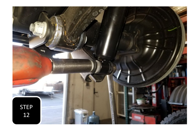
Step 12 Slide one of the washers and one of the bushings over the stem of the shock shaft and then slide it through the hole in the frame and install the other bushing, then washer, then nylock nut. Next, attach the bottom of the shock using the factory hardware and then tighten both the top and bottom shock mounts.