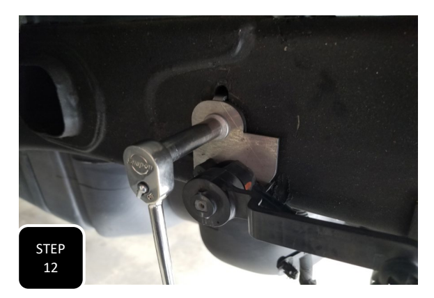
Step 12 Loosen the nut, flip it around the correct way and fully tighten it.