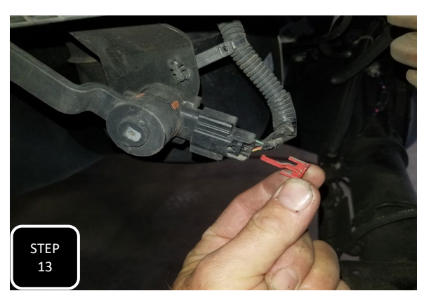
Step 13 Re-connect the plug at the sensor and then re-insert the red safety clip.