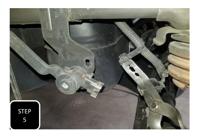
Step 5 Using a pair of suitable mounting clip pliers, remove the clip attaching the wire harness to the sensor mounting bracket.