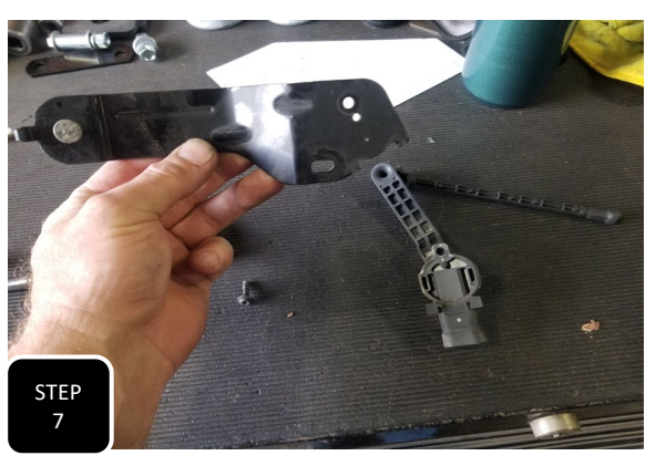
Step 7 Place the sensor face down on a bench and remove the torx head mounting screw. Next, separate the sensor from its mounting bracket.