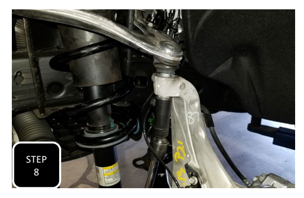
Step 8 Loosely install the top of the strut in the truck using the provided flange nuts. Next, place a floor jack under the lower control arm, remove the upper control arm nut, and then allow the lower control arm to go down until the bottom of the strut aligns above the control arm. NOTE: MAKE SURE TO KEEP THE TOP OF THE SPINDLE FROM FLOPPING SO THAT THE BRAKE LINE OR ABS LINE DO NOT GET TORN OR STRETCHED.