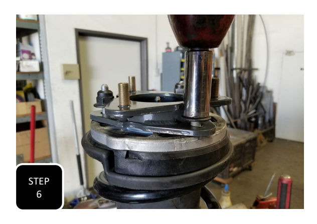
Step 6 Install the new strut spacer and attach using the factory strut top hardware.