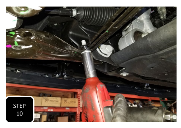
Step 10 Tighten the nuts at the top of the strut spacer then re-attach the lower control arm cross brace.