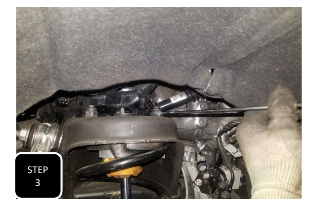
Step 3 Unbolt the two mounting bolts at the bottom of the strut along with the three nuts at the top of the strut.