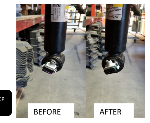
Step 5 Using an automotive coil/strut compressor, compress the coil so that the bottom of the strut can be rotated 180 degrees. NOTE: THE LOWER BAR PIN IS VULCANIZED AT AN ANGLE AND NEEDS TO BE ROTATED TO ANGLE IT IN THE PROPER DIRECTION AFTER INSTALLING THE STRUT SPACER.