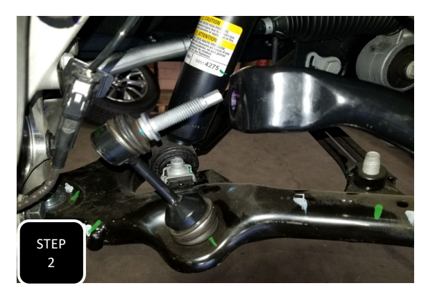
Step 2 Remove the nut attaching the sway bar end link to the sway bar and separate the two.