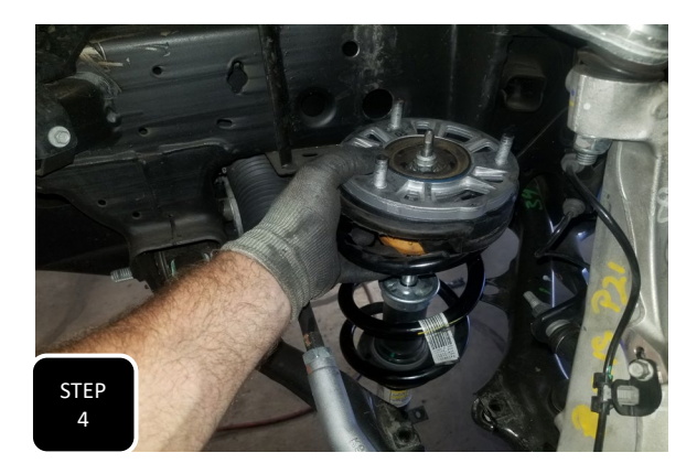
Step 4 Unbolt both of the bolts attaching the lower control arm cross brace to the lower control arm and remove. Next, remove the strut assembly through the opening in the lower control arm.