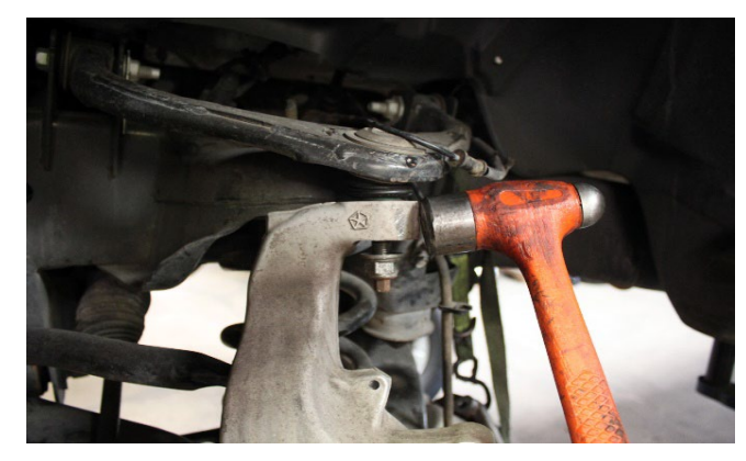
Step 6 Place a floor jack under the lower control arm and apply some pressure. Next, remove the upper ball joint nut and break the ball joint loose by hitting the side of the spindle, right at the ball joint, with a hammer.