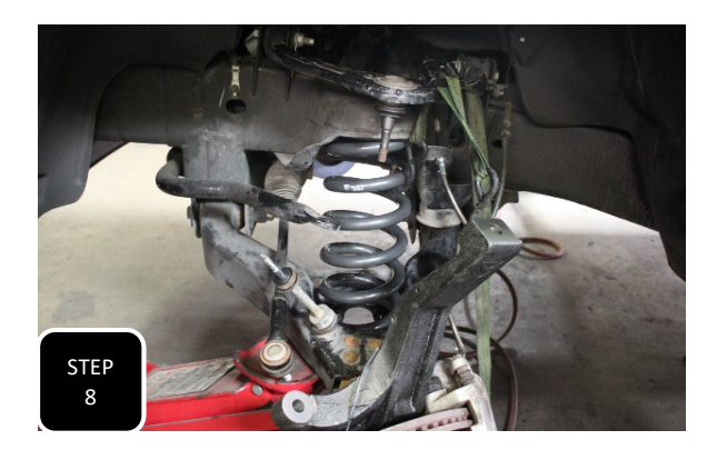
Step 8 Get the spring and spacer into place and apply some tension with the floor jack. Next, use a large pry bar to apply inward pressure on the spring while you jack the lower control arm up. Once the control arm is flat, the coil spring will no longer want to pop out and the pry bar can be removed. NOTE: THE USE OF AN INTERNAL COIL COMPRESSOR, OTC PART # 7045B WILL GREATLY EASE THE INSTALL PROCESS.