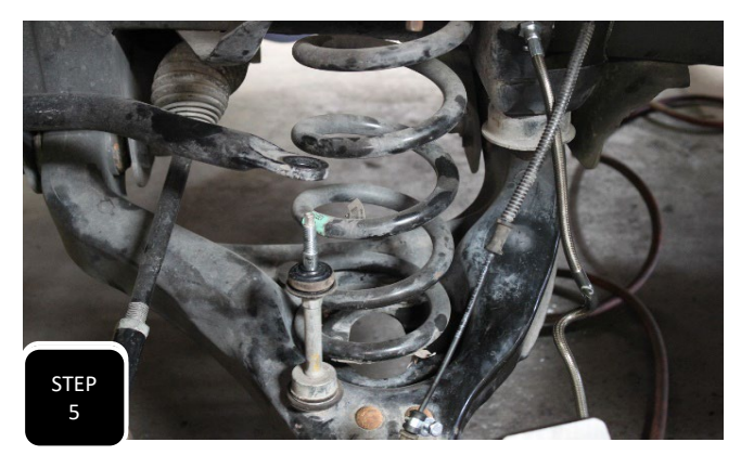
Step 5 Unbolt the sway bar from the sway bar end link.