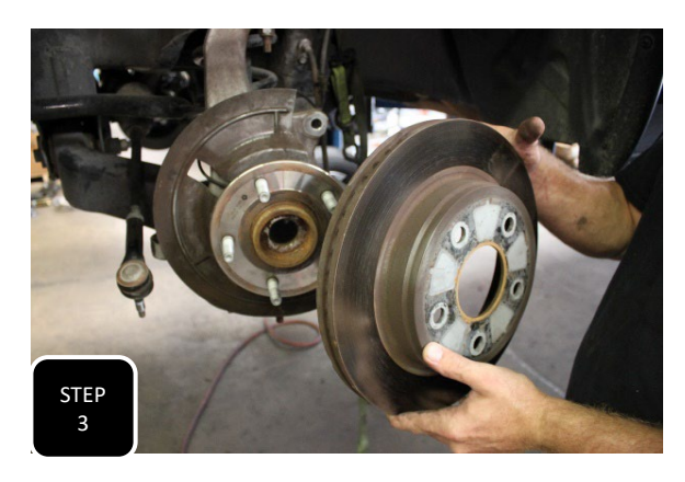
Step 3 Unbolt the brake caliper and support out of the way. Next, remove the brake rotor. NOTE: NEVER ALLOW THE BRAKE CALIPER TO HANG BY THE BRAKE LINE.