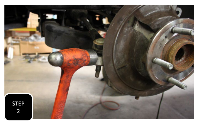
Step 2 Unbolt the tie rod and break it loose by hitting the side of the spindle, right at the tie rod, with a hammer.