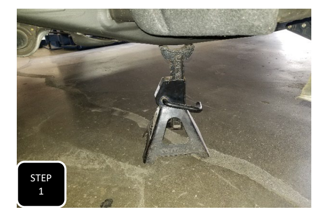
Step 1 Jack up the front of the truck and support under the frame rails with jack stands. Keep the floor jack under the lower control arm for height adjustment during the install.