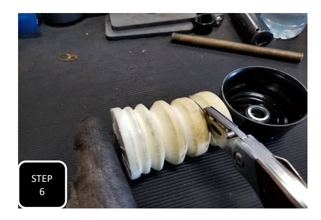
Step 6 Locate the factory bump stop, remove it from the metal cup, and cut one rib off of the end of it.