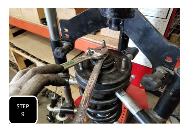
Step 9 Re-install the strut top and tighten down using the factory nut. NOTE: MAKE SURE TO PROPERLY CLOCK THE STRUT TOP WITH THE BOTTOM OF THE STRUT.