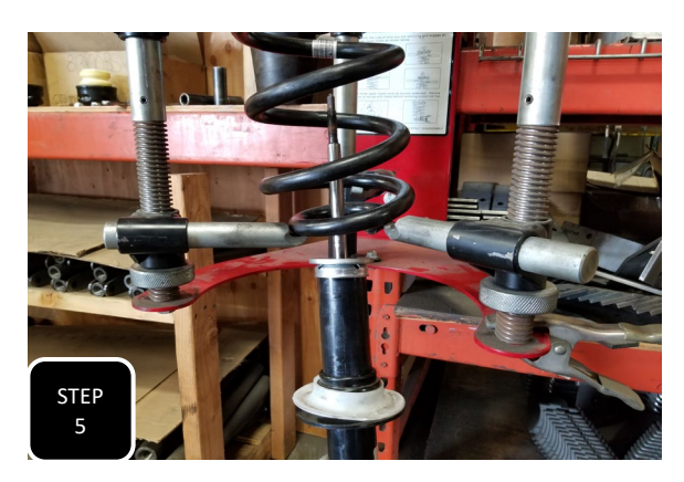
Step 5 Once the nut is removed, pull the strut top off, remove the bump stop and remove the strut out the bottom of the coil. NOTE: FOR SOME YEAR RANGES, THE BUMP STOP CUP IS ONE PIECE WITH THE STRUT TOP.