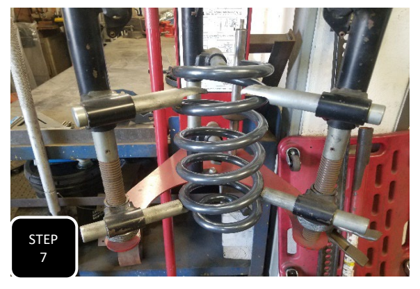
Step 7 Remove the factory spring from the strut compressor, locate your new lowering spring, and compress it in the spring compressor.