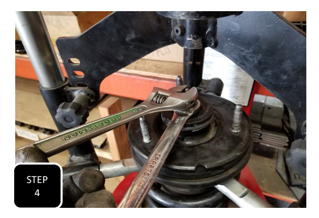
Step 4 Using an automotive coil/strut compressor, compress the coil so that the strut can be disassembled safely and then remove the nut at the center of the strut top. NOTE: PAY ATTENTION TO THE ORIENTATION OF THE STRUT TOP TO THE BOTTOM BARPIN FOR RE-ASSEMBLY.