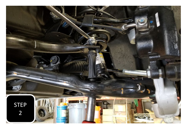
Step 2 Unbolt and remove the sway bar end link.