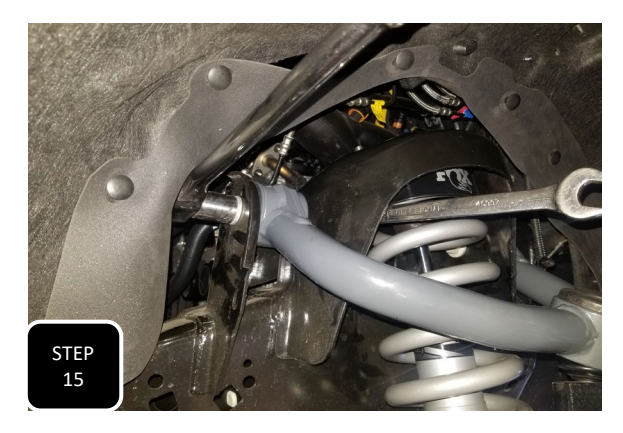
Step 15 Repeat steps 1-14 on the other side. Once both sides are complete and the vehicle is back on the ground at ride height, then fully tighten the bolts attaching the upper control arm to the frame.