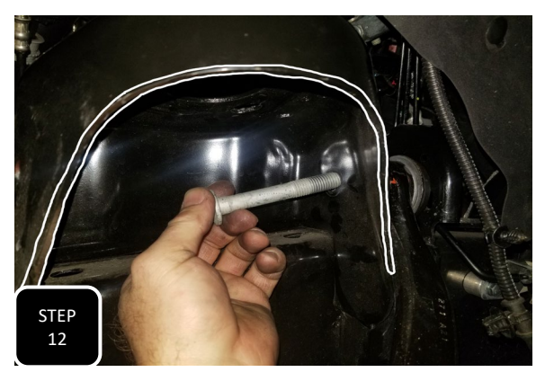
Step 12 Remove the bolts and the control arm.