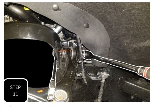
Step 11 Unbolt both bolts attaching the upper control arm to the frame.