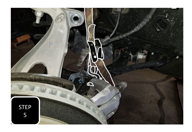
Step 5 Unbolt both brake caliper bolts and support the brake caliper up out of the way. NOTE: NEVER ALLOW THE BRAKE CALIPER TO HANG FROM THE BRAKE LINE.