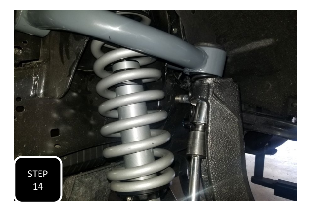
Step 14 Reverse steps 1-10 to re-install the strut or coil over and your spindle. Next, attach the upper control arm to the spindle using the provided nut and tighten.