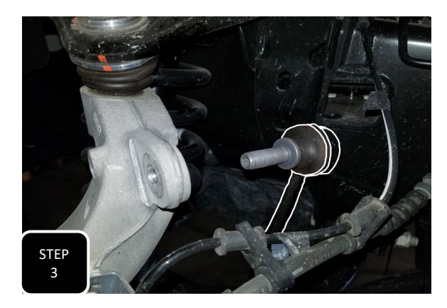
Step 3 Unbolt the sway bar end link from the neck of the spindle and separate.