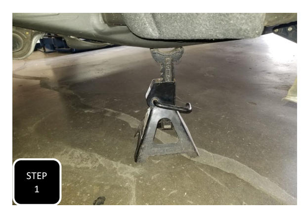
Step 1 Jack up the front of your vehicle and support under the frame with jack stands.