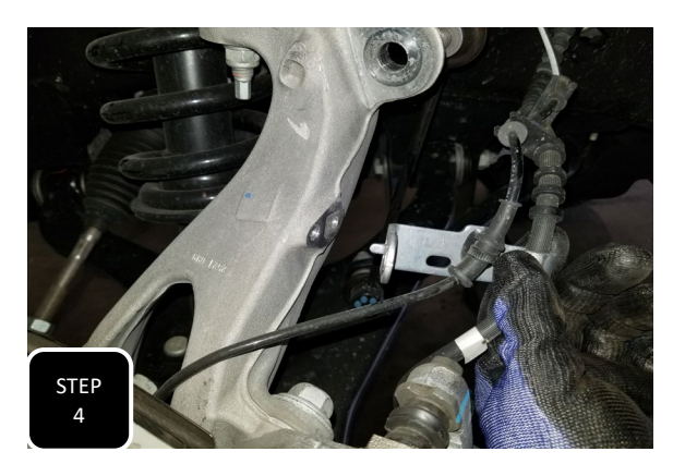
Step 4 Unbolt the brake line guide bracket from the neck of the spindle and separate.