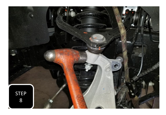
Step 8 Loosen the nut at the upper ball joint, but do not fully remove it. Next, break the ball joint loose by hitting the side of the spindle, right at the ball joint, with a hammer. The nut will catch the spindle. NOTE: NEVER HIT THE BALL JOINT ON THE THREADS.