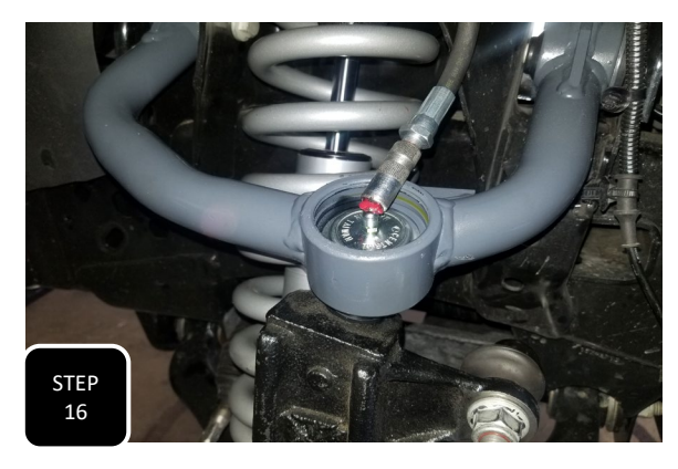
Step 16 Pop the cap off of the top of the ball joint and add some grease to the grease fitting using a grease gun.