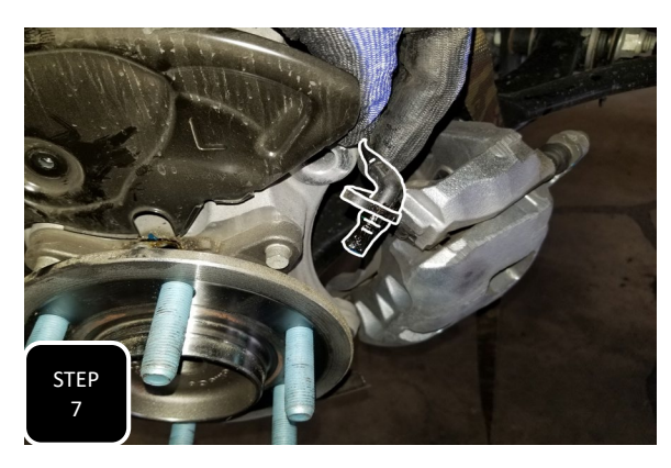
Step 7 Unbolt the ABS sensor from the top of the hub, remove it, and then hang it up out of the way so that it does not get damaged during the install.