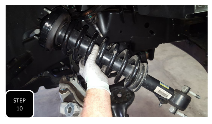
Step 10 Remove the 3 mounting nuts at the top of the strut along with the 2 mounting nuts at the bottom. Next, with your knee or a pry bar, press down on the lower control arm so that the top of the strut separates from the coil bucket and then remove the strut.