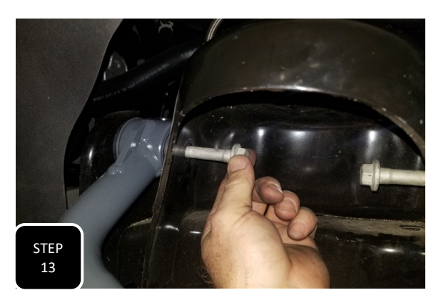
Step 13 Locate the new control arm with a ball joint that is off-set the same way as the control arm that you just removed and attach it to the frame using the factory bolts installed from the inside of the coil bucket outwards. NOTE: DO NOT FULLY TIGHTEN THESE BOLTS UNTIL THE VEHICLE IS ON THE GROUND AT RIDE HEIGHT.