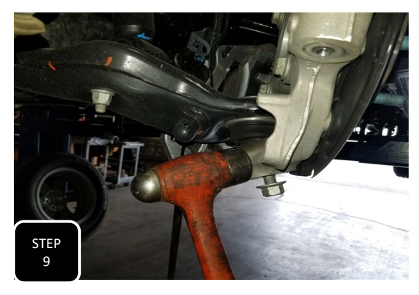
Step 9 Loosen the nut at the lower ball joint, but do not fully remove it. Next, break the ball joint loose by hitting the side of the spindle, right at the ball joint, with a hammer. The nut will catch the spindle then you can fully remove the spindle. NOTE: NEVER HIT THE BALL JOINT ON THE THREADS.