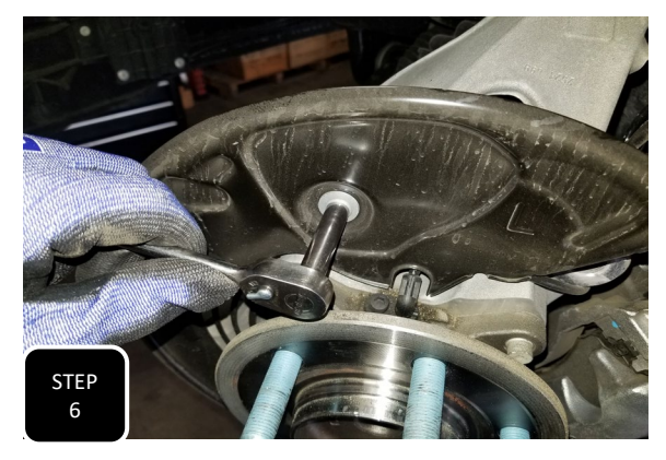
Step 6 Remove the free floating brake rotor and then remove the upper mounting bolt on the dust shield behind it. NOTE: IF THE BRAKE ROTOR DOES NOT JUST COME OFF, IT WILL HELP TO SPRAY WD-40 AROUND THE MIDDLE HOLE AND THEN HIT THE WHEEL MOUNTING SURFACE WITH A HAMMER TO JAR IT LOOSE.