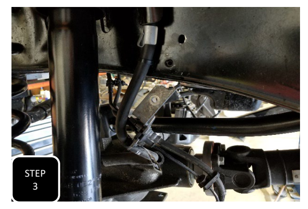
Step 3 Unbolt both front brake line brackets from the frame and pull the bracket away from the frame.