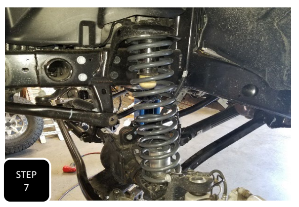
Step 7 Locate the new front coil springs and aluminum bump stop extensions. Hold the bump stop extensions inside the coils and install the springs onto the truck.