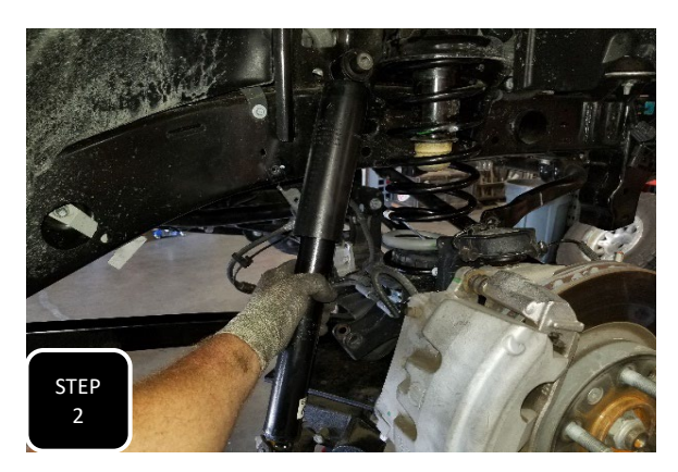
Step 2 Working on both sides at the same time, apply some pressure on the axle with the floor jack centered under the front axle and then unbolt both front shocks at both ends and remove.