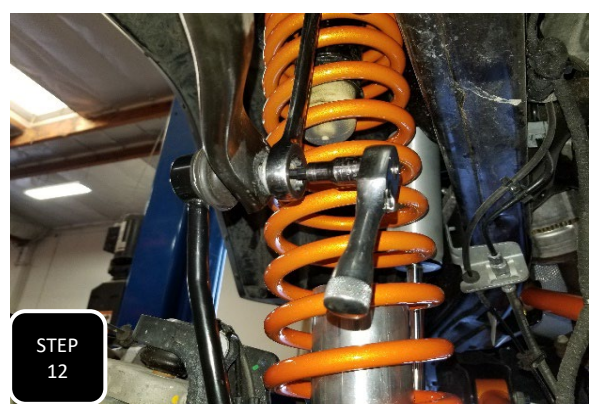
Step 12 Install the factory rear sway bar end links on the front using the factory hardware.