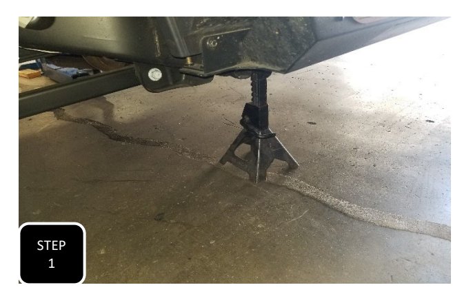
Step 1 Jack up the front of the vehicle and support under the frame with jack stands. Keep an adjustable jack under the axle for height adjustment.