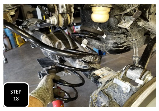
Step 18 Lower down the axle and remove both coil springs.