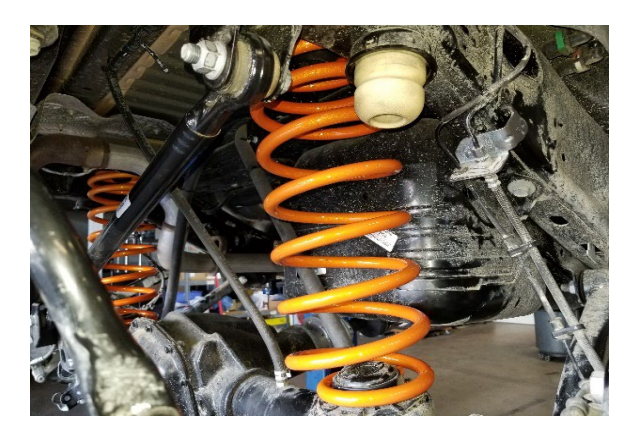
Step 20 Install the new coil spacers on the lower coil mount and then re-install the plastic isolator. Next, install the new springs and jack up the axle until both springs are properly seated.