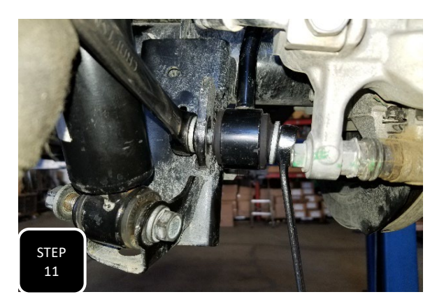
Step 11 Your factory rear sway bar end links will get used in the front so now proceed to the rear of the truck and remove both factory sway bar end links.