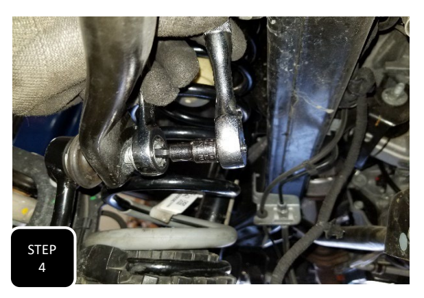
Step 4 Unbolt both front sway bar end links at both ends and remove.