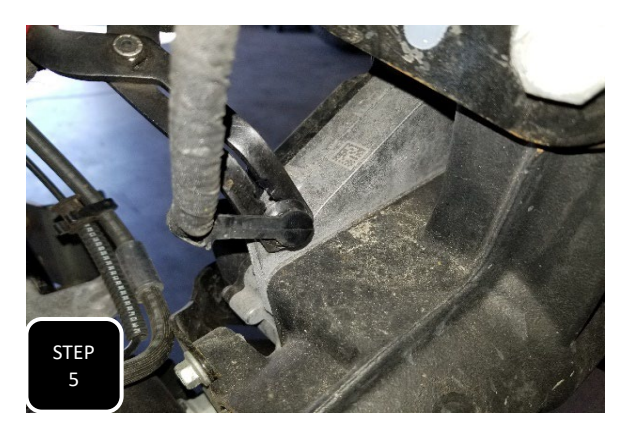
Step 5 Before lowering the front axle, release the two wire guide clips for the front differential wiring so that the wiring does not get damaged during the install.