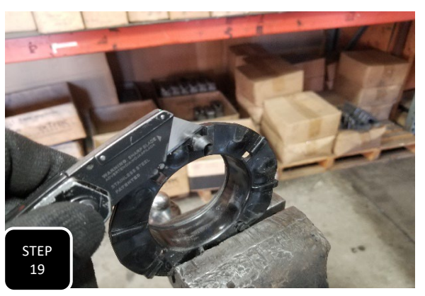
Step 19 Remove the plastic lower coil isolator and cut off the guide nipple using a suitable cutting device.