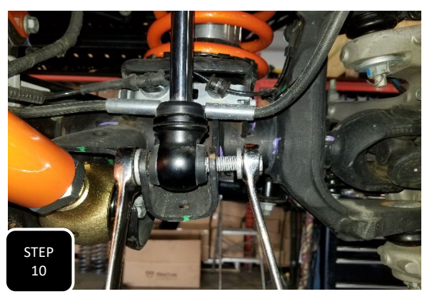
Step 10 Once the mounting hardware has been installed, install the shocks on the truck using the factory bolts top and bottom. Torque bolts to 55 ft/lbs.