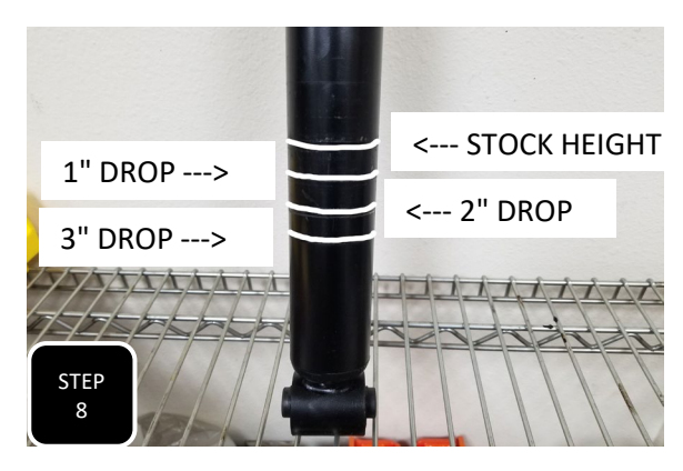
Step 8 Locate the new lowering strut and set the retainer clip in the appropriate groove for the amount of drop that you are looking to achieve. The top groove is stock, next down is 1" drop, then 2" drop, and 3" drop.