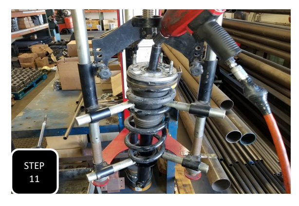
Step 11 Install the new strut into the coil along with the factory bump stop and tighten using the provided nylock nut. NOTE: ENSURE THAT THE TOP THREE STUDS ARE POSITIONED IN THE CORRECT ORIENTATION IN RELATION TO THE BOTTOM SLEEVE.