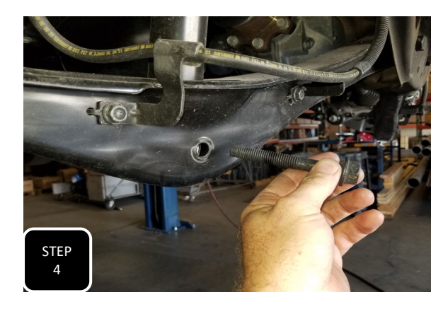
Step 4 Loosen and remove the lower strut mounting bolt and save for re-installation.