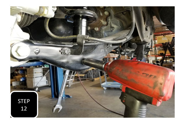
Step 12 Re-install the strut back onto the vehicle using the factory hardware. You can tighten down the upper nuts, but do not fully tighten the lower bolt until the vehicle is on the ground at ride height.