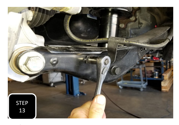
Step 13 Re-install the control arm bolt at the spindle and tighten to factory specs. Next, re-attach the brake line bracket using the factory bolt and tighten.