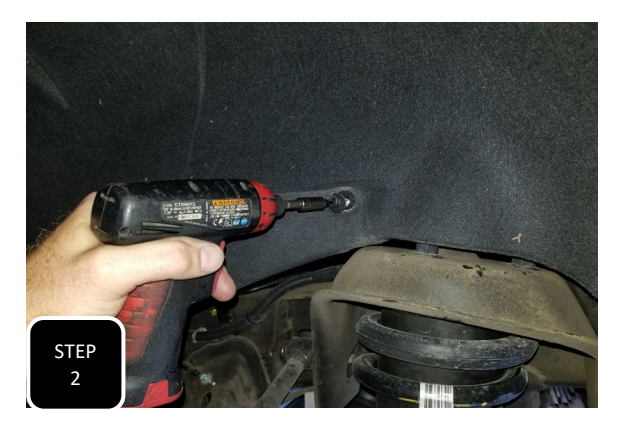
Step 2 Remove the two torx head bolts that attach the wheel well skirt to allow easier access to the top of the strut.