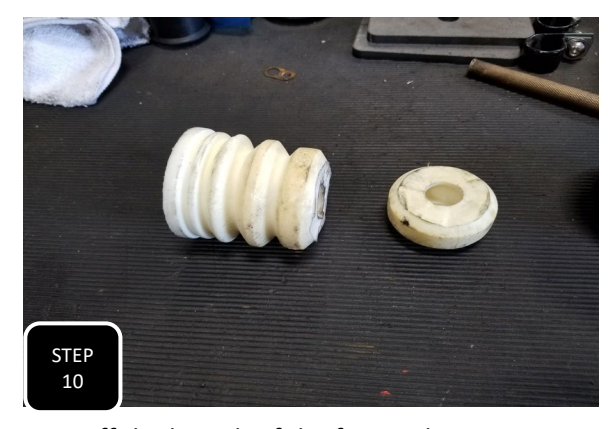
Step 10 If installing the strut at the 3 drop level, you will need to trim off the last rib of the factory bump stop.