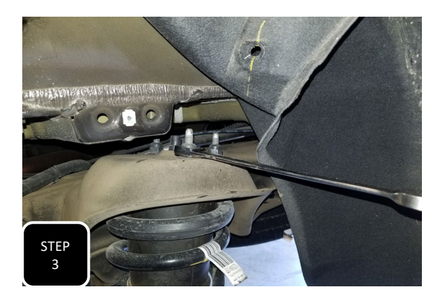
Step 3 Remove the three nuts attaching the top of the strut to the frame and save for re-installation.