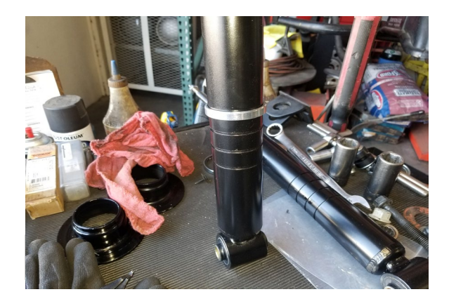
Step 9 Slide the retainer clip collar down over the retainer clip. Make sure that it slides completely over the clip and rests down on the inside, machined lip then install the lower coil seat over that.