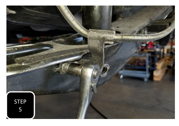
Step 5 Unbolt the brake line guide bracket from the lower control arm and separate.