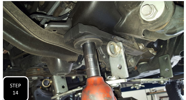
Step 14 Place an adjustable jack under the front differential and remove the two front mounting bolts. NOTE: THERE IS ONE MORE DIFF MOUNT TOWARDS THE BACK ON THE DRIVER'S SIDE THAT THE DIFF WILL PIVOT DOWNWARD ON.