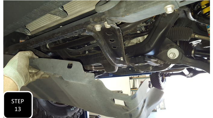
Step 13 Unbolt all 4 bolts holding the primary skid plate on and remove the skid plate.