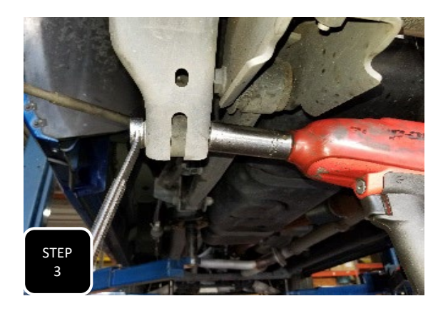
Step 3 Apply a little bit of pressure to the differential with the jack and then unbolt both shocks at the axle and separate.