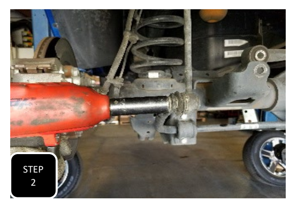
Step 2 Unbolt both sway bar endlinks at the sway bar and separate.