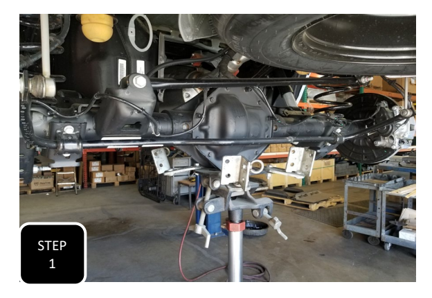
Step 1 Jack up the rear of the vehicle and support under the frame rails with jack stands. Keep an adjustable jack under the differential for height adjustment.