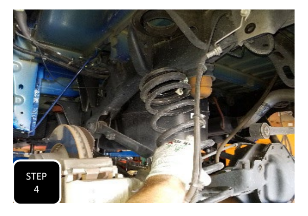
Step 4 Lower the axle and remove both rear coils. NOTE: BE CAUTIOUS NOT TO STRETCH OR DAMAGE ANY BRAKE LINES OR ABS LINES.