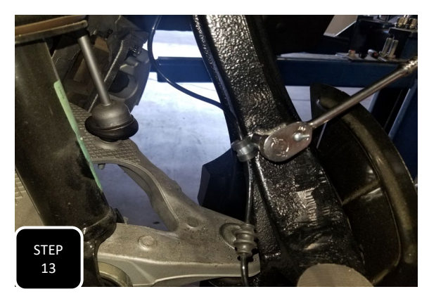
Step 13 Re-install the ABS sensor into the wheel bearing using the factory bolt and then remove the factory wire guide bracket from the rubber grommet on the wire just above the sensor and discard. Locate one of the provided 1/4" loom clamps and attach the ABS wire to the mounting hole on the neck of the spindle, just above the steering arm using the provided 6mm bolt.