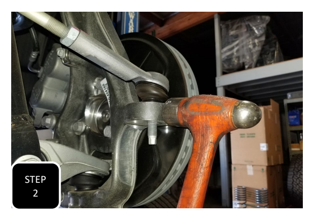
Step 2 Unbolt the outer tie rod at the spindle and break loose by hitting the side of the spindle with a hammer and separate. NOTE: NEVER HIT THE TIE ROD ON THE THREADS.