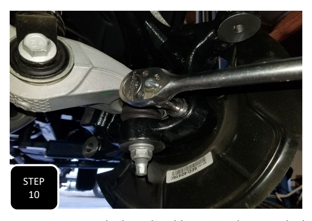
Step 10 Attach the wheel bearing along with the factory dust shield and tighten.