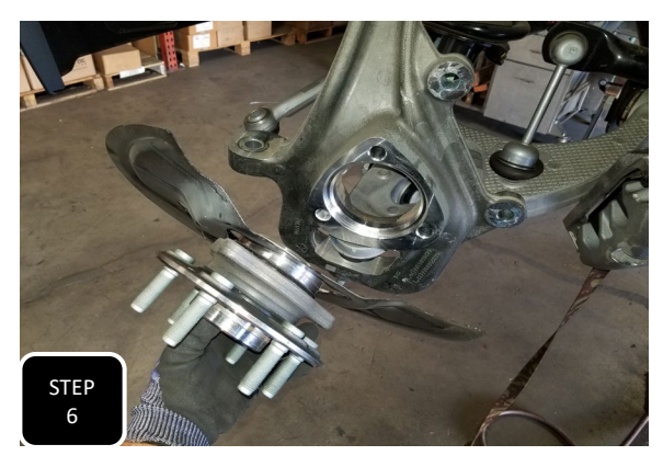
Step 6 Unbolt the 3 bolts attaching the wheel bearing to the spindle and remove the wheel bearing along with the dust shield.