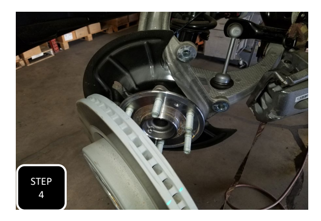
Step 4 Unbolt the retainer screw attaching the rotor to the drive flange and remove the rotor.