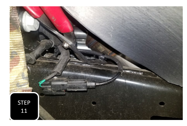
Step 11 Separate the 1 ABS guide clip at the upper control arm and the 2 on the frame behind the ABS plug by prying between each clip and the frame.