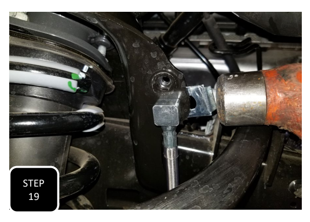
Step 19 If the brake line fitting does not slide through the factory mounting hole then give it a couple taps with a hammer so that you can engage the mounting clip on the back side. Once seated, install the mounting clip and tap into place with a hammer.