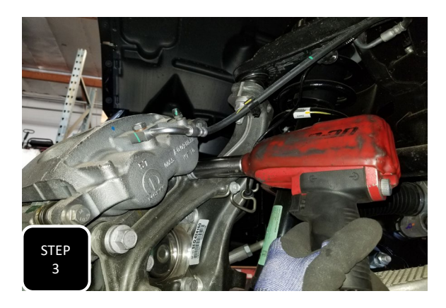
Step 3 Separate the clip attaching the ABS line to the brake line and then unbolt the brake caliper and support it up, out of the way. NOTE: NEVER ALLOW THE BRAKE CALIPER TO HANG BY THE BRAKE LINE.