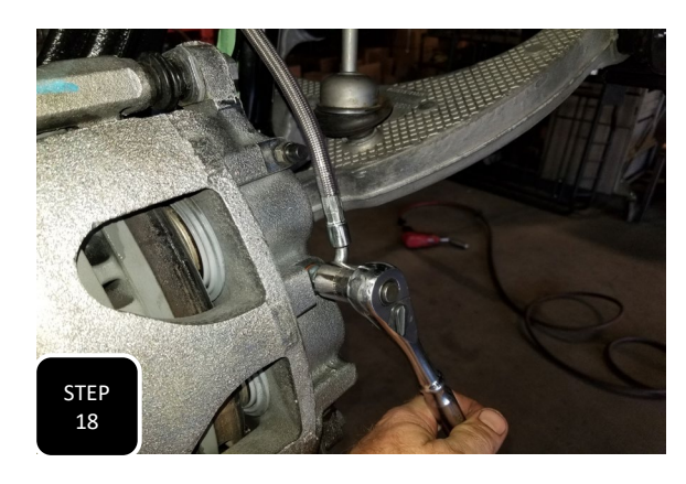
Step 18 Attach the new, extended brake line at the frame first and allow fluid to run through the line before attaching it to the brake caliper. Using the stock banjo bolt and the provided crush washers, attach the brake line to the brake caliper and orient the line so it points upward, then tighten.