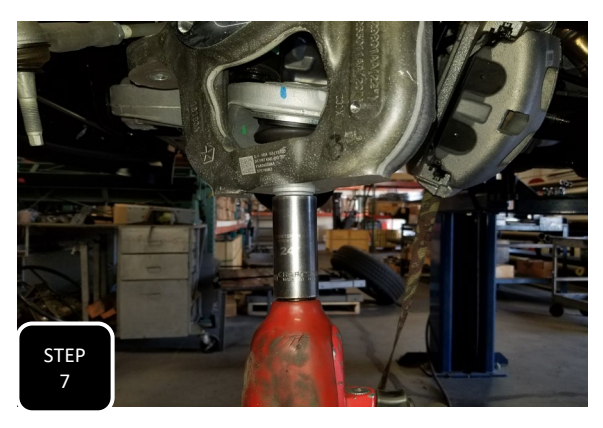
Step 7 Unbolt both the upper and lower ball joint nuts, but do not remove.