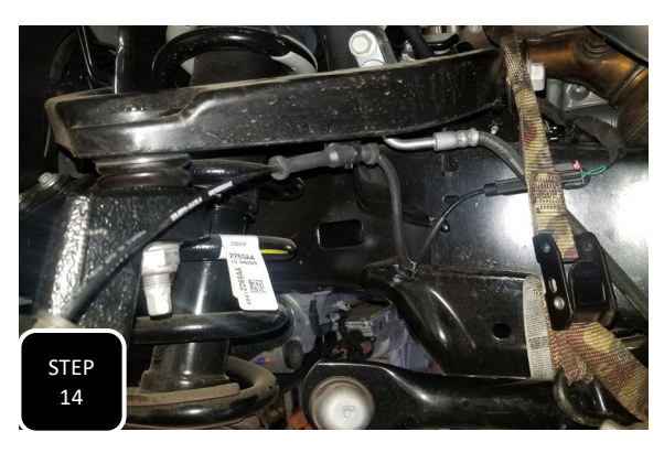
Step 14 RE-connect the ABS plug and then attach it to the frame in the opposite direction that it was originally attached. Next, re-attach the ABS wire guide clip to the mount on the upper control arm.