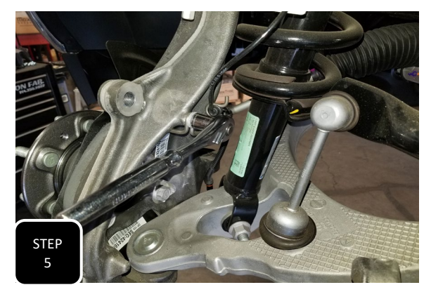
Step 5 Unbolt the ABS sensor from the wheel bearing and also unbolt the wire guide bracket on the back side of the spindle. Hang the sensor out of the way so that it does not get damaged during the install.