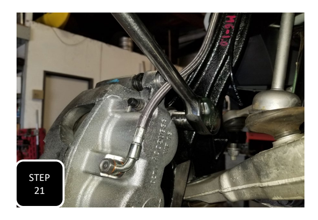
Step 21 Tighten up the brake caliper bolts then move to the other side.