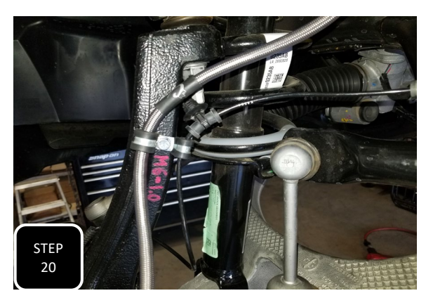
Step 20 Locate a provided 1/4" and 3/8" loom clamp. Use these clamps to attach the brake line and ABS line to the neck of the spindle on the caliper side using a provided M6 bolt and washer.