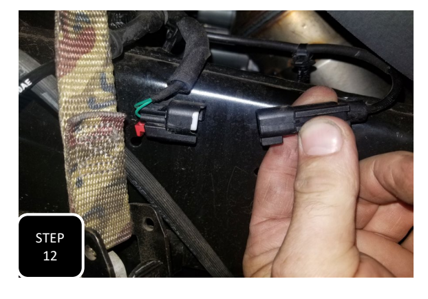
Step 12 Unclip the ABS plug from the frame by prying between the two and then separate the plug by first sliding back the "red" safety clip and then depressing the button and pulling apart.