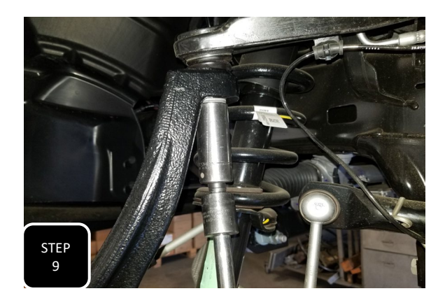
Step 9 Install the new spindle using the factory ball joint nuts and tighten.