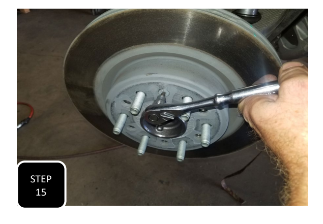
Step 15 Slide the rotor over the wheel lugs and tighten up the factory rotor retainer bolt.