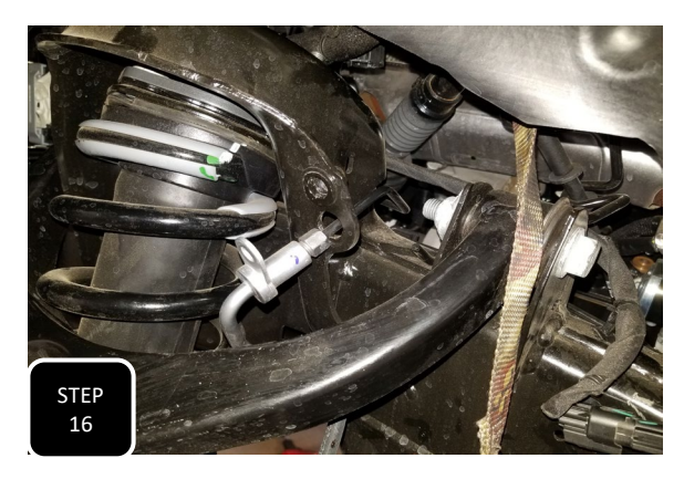
Step 16 Unbolt the brake line from the frame and pull the hard line through the mounting hole a bit to gain some slack in the line then loosely attach the brake caliper to the new spindle.