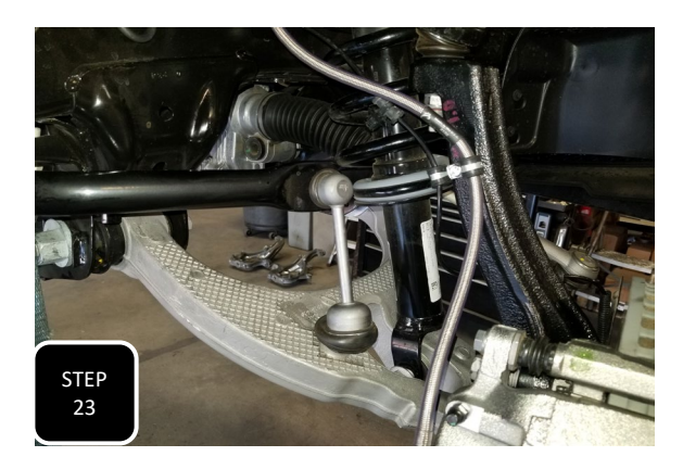
Step 23 When routing the ABS line on the passenger side, use the extra holes in the frame to neatly attach the line, but ensure there is enough slack so that the line does not get tight at full droop and full turn.