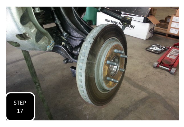
Step 17 Install the brake rotor onto the wheel studs.

Step 16 Use the supplied 1/4" and 3/8" adel clamps along with the supplied M6 bolts to guide the ABS wire safely up the neck of the spindle. The larger 3/8" clamp will be installed over a rubber sleeve on the wire. Cycle the spindle back and forth in its turn radius to ensure there is enough slack in the ABS wire.