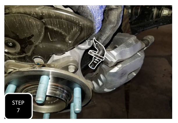
Step 7 Unbolt the ABS sensor from the top of the hub, remove it, and then hang it up out of the way so that it does not get damaged during the install.