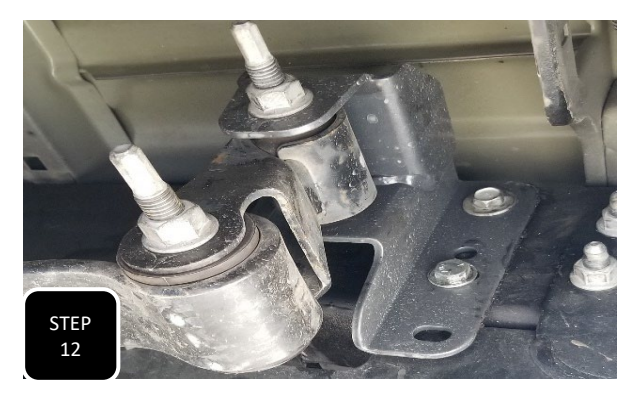
Step 12 Before installing the hanger, attach the shackle to the hanger using the factory bolt, oriented from the inside out.