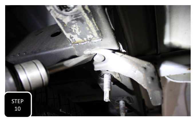
Step 10 Next, you will need to chissel off the remainder of the heads using a pneumatic hammer with a chissel attachment and then finally punch out the body of the rivot using a pneumatic hammer with a punch attachment. Older models will have one more rivet attaching a support bracket to the bottom of the frame. This bracket will be welded on newer models and needs to be cut off.