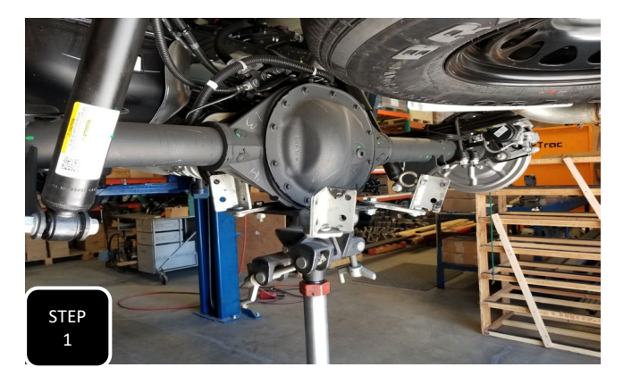
Step 1 Jack up the rear of the vehicle and support under the frame rails with jack stands. Leave an adjustable jack under the differencial for height adjustment.