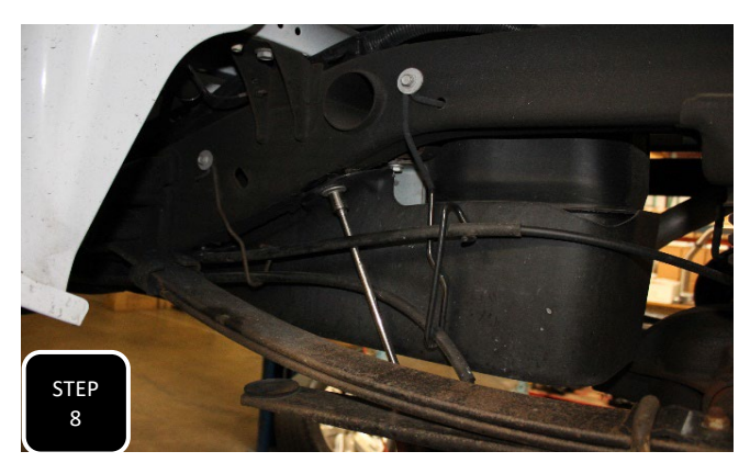
Step 8 Working on one side at a time, remove the U-bolts and lower the axle away from the leaf spring. Next, pull the leaf spring/shackle out, around, and under the shackle mounting hanger. Now re-attach the leaf spring to the axle and torque the U-bolts to 100 ft/lbs. REPEAT THIS STEP WITH THE OTHER LEAF SPRING.