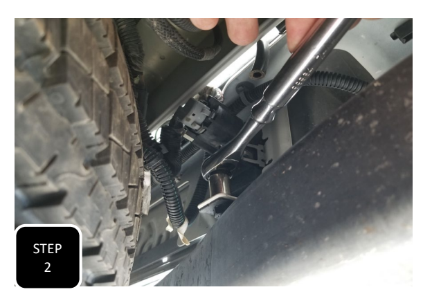
Step 2 Unbolt the 6 bolts which attach the trailer hitch to the frame and remove the trailer hitch. NOTE: THERE WILL ALSO BE TWO SMALL BOLTS THAT ARE HIDDEN UP NEAR THE SPARE TIRE ATTACHING THE HITCH TO THE BUMPER.