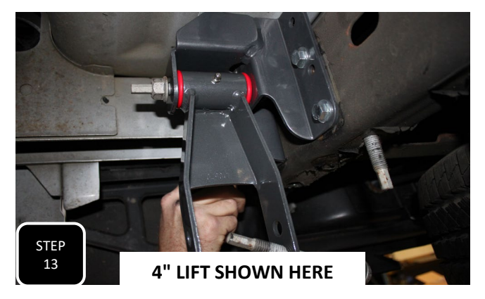
Step 13 If installing the hangers in the 2 & 4 holes, you will need to bend the bed seem, directly above the spring hanger, for additional clearance.