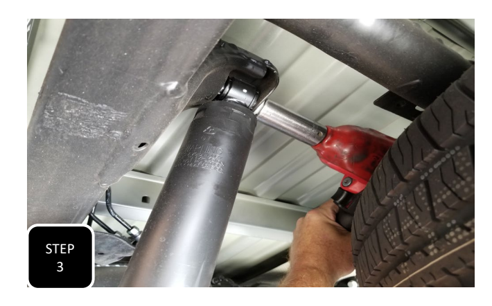
Step 3 Jack up the jack slightly to apply pressure to the axle then unbolt both shocks at both ends and remove.