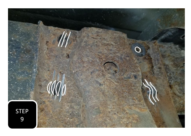
Step 9 With the leaf springs now out of the way, you will need to remove the rear, shackle hanger by making multiple cuts into the head of each of the 3 mounting rivets using a 4.5" cut off wheel. The bolt at the upper hole can just be un-bolted and saved for re-installation.