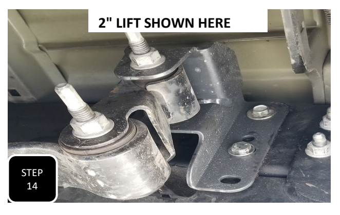
Step 14 Attach the hanger with the shackle pre-assembled into it. The shackle can be installed with the open end facing either direction. The hanger will get attached using 3 of the provided 7/16" bolts and re-using the one factory bolt. NOTE: THE SHACKLE CANNOT BE INSTALL AFTER THE HANGER IS INSTALLED.