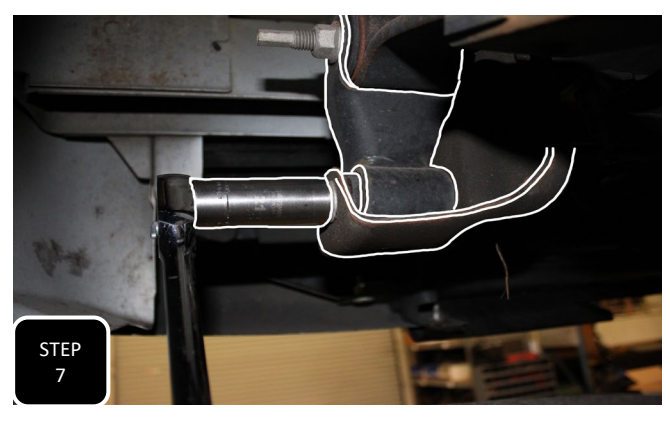
Step 7 Unbolt the shackle mounting bolt on both sides and remove.