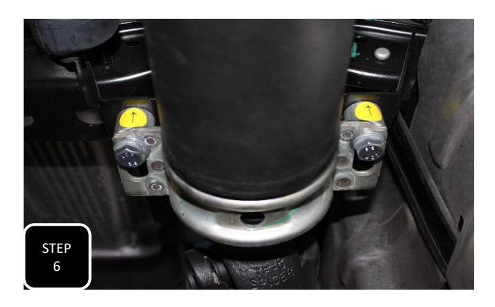
Step 6 One at a time, remove a carrier bearing mounting bolt and install one of the provided spacers along with the new M10 bolt and washers. The spacer will have a yellow sticker with an arrow on it. This sticker needs to face the front of the truck with the arrows pointed upward. This will give the carrier bearing a little bit of a downward slope towards the axle.