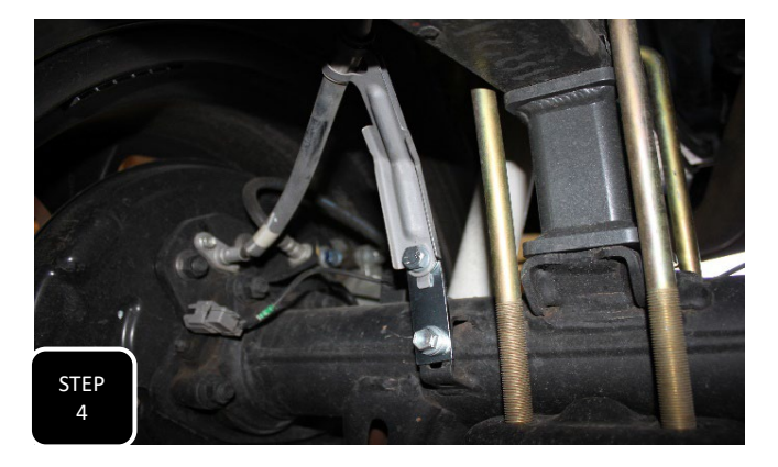
Step 4 Moving to the front of the axle, locate the two E-brake cable brackets located just outward of the leaf spring mounts. Unbolt the guide brackets and install the new E-brake extension brackets with the bent side facing up and attach using the provided M8 hardware at the brackets and the factory bolt at the axle.