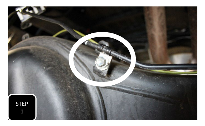
Step 1 The hard brake lines on the axle housing have guide clamps that orient downward. Unbolt the clamps, remove and re-install them facing upward.