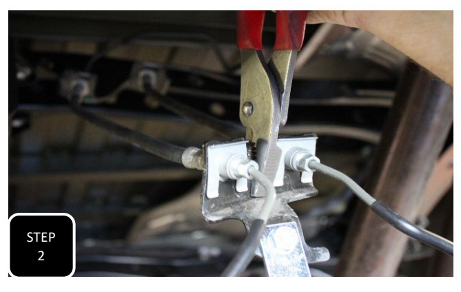
Step 2 Unbolt the brake line bracket at the top of the differential, gently stretch the harlines to space the bracket up from the diff, and then install the new brake line bracket using the provided M8 hardware at where the brackets meet and the factory bolt at the diff.