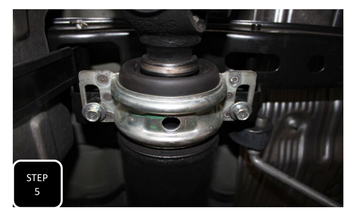
Step 5 Locate the carrier bearing in the middle of the two drive shafts and loosen, but do not fully remove both bolts.