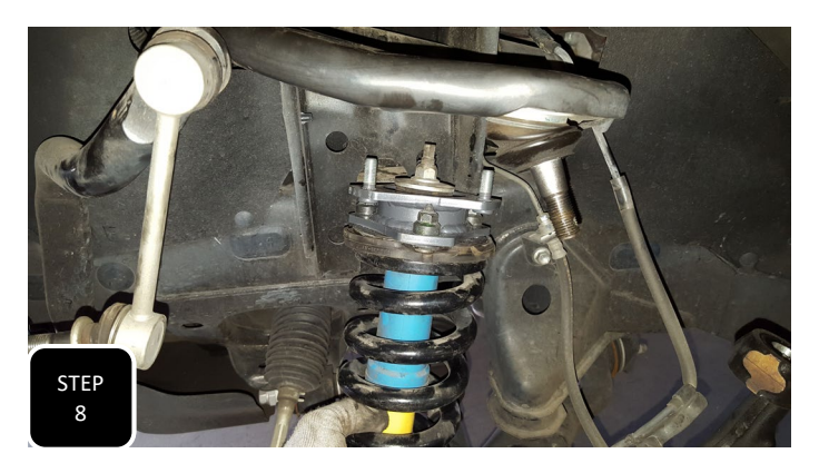
Step 8 Re-install the strut assembly back into the truck and loosely attach the hardware at the top and bottom.