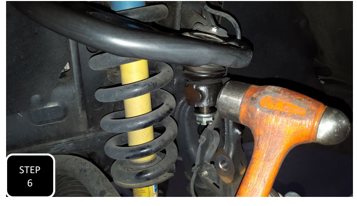
Step 6 Remove the clip at the upper ball joint and then loosen the nut, but do not remove. Break the ball joint loose by hitting the side of the spindle with a hammer, the nut will catch the spindle, then separate. NOTE: NEVER HIT THE BALL JOINT ON THE THREADS.