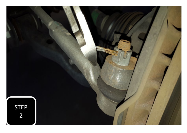
Step 2 Remove the cotter pin that is engaged in the outer tie rod end.