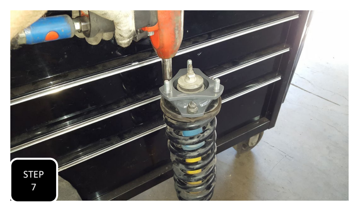
Step 7 Remove the strut and then attach the strut spacer to the top of the strut using the factory nuts and tighten.