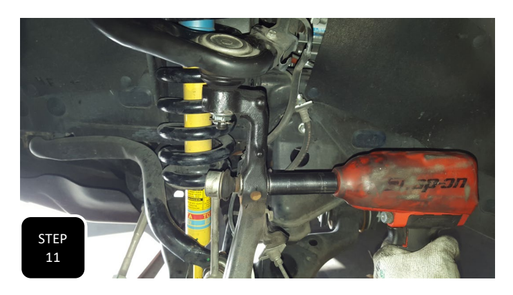
Step 11 Re-attach the sway bar end link to the spindle and tighten. NOTE: THIS STEP SHOULD BE DONE AFTER THE SPACERS HAVE BEEN INSTALLED ON BOTH SIDES.