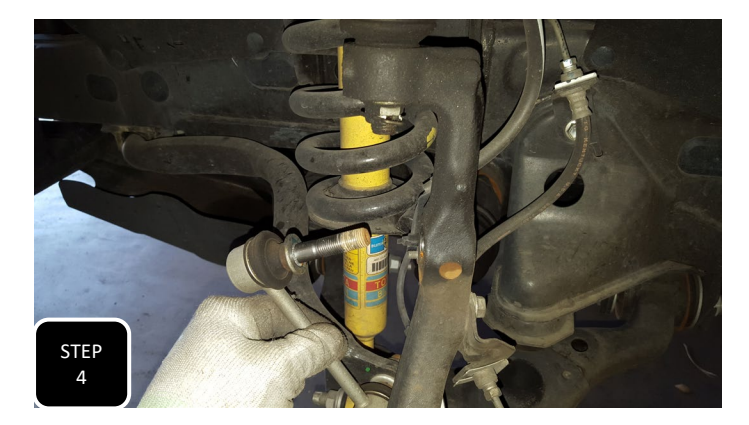
Step 4 Unbolt the sway bar end link from the neck of the spindle and separate.