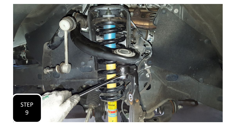
Step 9 Place a floor jack under the lower control arm and jack up to compress the coil. Now re-attach the upper control arm to the spindle, tighten the castle nut, and re-install the factory clip.