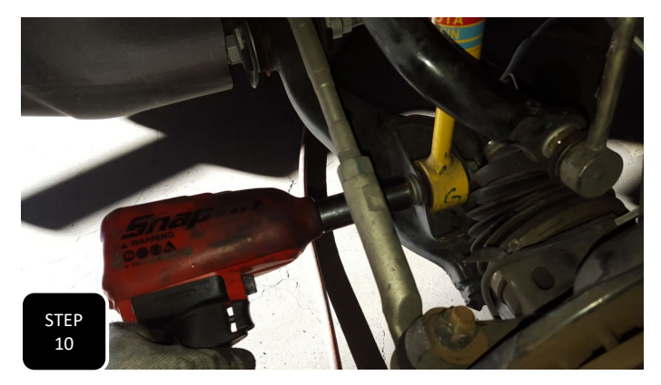
Step 10 Tighten the provided nuts at the top of the strut and the factory bolt at the bottom.