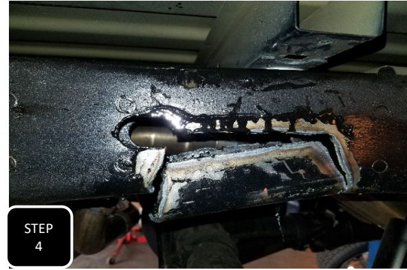
Step 4 Cut out the scribed line using a plasma cutter or other suitable cutting device