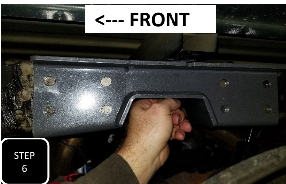
Step 6 Check for proper fitment and clearance as needed until the frame support fits flush to the frame. The more triangulated side that bends wider will mount towards the front of the truck.