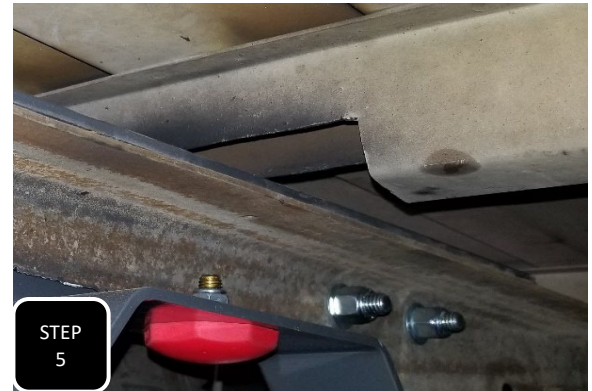
Step 5 Before being able to test fit the frame support, you may need to trim the bed rib, directly above, if your truck is equipped with one. Using a suitable cutting device, trim the bed rib about 1/2" up from the bottom. Trim from the end of the rib to at least the inside edge of the frame to ensure an easy install of the frame support and no contact of the two.