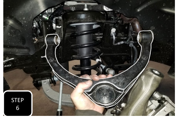
Step 6 Pull the upper ball joint out of the spindle and gently allow the spindle to flop to the side. Next, remove the upper control arm.