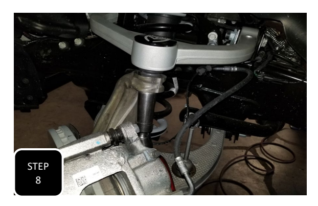
Step 8 Attach the upper control arm to the spindle using the provided nylock nut and washer, then tighten.