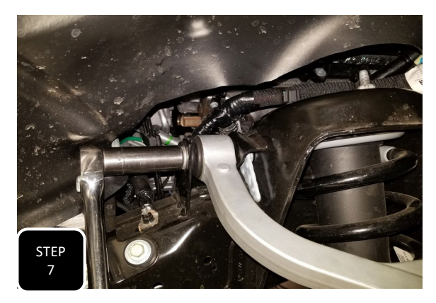
Step 7 Locate the new upper control arm which has the ball joint off-set the same way as the arm you just took off. Now, loosely install the new arm using the factory bolts at the frame. NOTE: DO NOT FULLY TIGHTEN THE BOLTS AT THE FRAME UNTIL THERE IS WEIGHT ON THE SUSPENSION LIKE THE TRUCK IS AT ITS NORMAL RIDE HEIGHT.