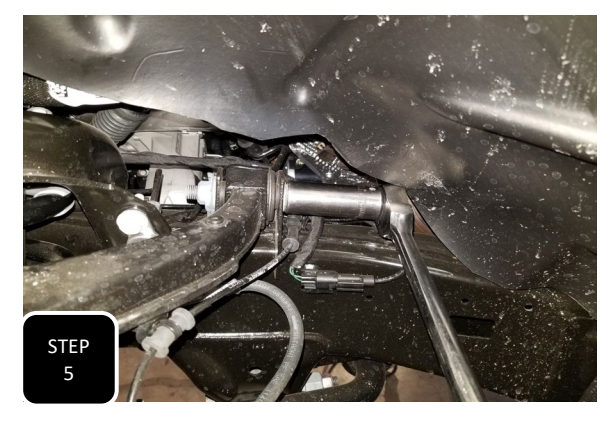
Step 5 Loosen and remove both bolts attaching the upper control arm to the frame and save for re-installation.