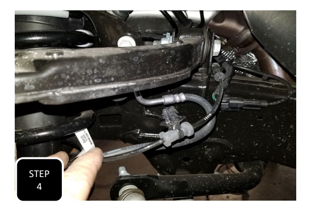
Step 4 Separate the ABS wire mounting clip from the bracket on the upper control arm.