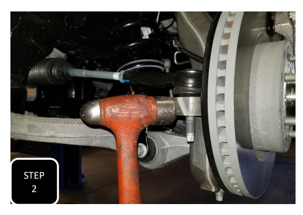
Step 2 Unbolt the tie rod at the spindle and break loose by hitting the side of the spindle, right at the tie rod, with a hammer, then separate. NOTE: NEVER HIT THE TIE ROD ON THE THREADS.