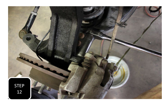
Step 12 Attach the brake caliper to the spindle using the factory bolts and torque to 80 ft/lbs.