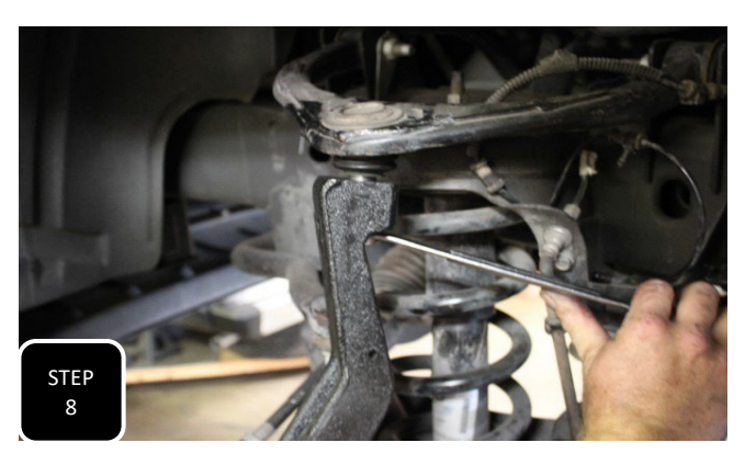
Step 8 Locate the new spindle that matches the orientation of the spindle that you just removed and install it. The lower ball joint will get torqued to 150 ft/lbs. The upper ball joint has limited access and will get tightened down using a 12 point, 21mm combination wrench. NOTE: IF THE UPPER BALL JOINT SPINS WHEN TIGHTENING, USE A PRY BAR ON TOP OF THE UPPER CONTROL ARM TO WEDGE THE BALL JOINT INTO THE TAPERED HOLE WHILE TIGHTENING.