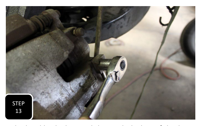
Step 13 Using a line wrench, break loose the soft brake line from the hard brake line and then unbolt the soft brake line from the brake caliper.