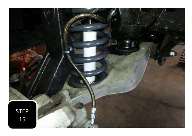
Step 15 Push the end of the soft line up against the frame and attach using the provided "U" shaped clip and tap it into place using a hammer. Next, attach the brake line to the neck of the spindle using the supplied 3/8" Adell clamp and M6 bolt. NOTE: YOU WANT THE LINE TIGHT FROM THE CALIPER TO THE CLAMP TO CREATE AS MUCH SLACK AS POSSIBLE BETWEEN THE CLAMP AND FRAME MOUNT.