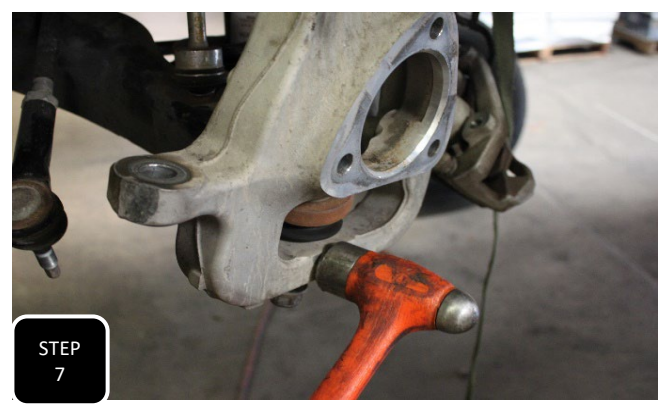
Step 7 Loosen the lower ball joint nut, but do not remove. Next, break the ball joint loose by hitting the side of the spindle, right at the ball joint, with a hammer. The nut will catch the spindle then remove both the nut and the spindle. NOTE: NEVER HIT THE BALL JOINT ON THE THREADS.