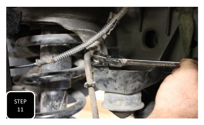
Step 11 Slide the brake rotor onto the wheel bearing. Next, unbolt the brake line at the frame and slightly stretch the factory harline so it is easier to access the hardline to soft line connection.