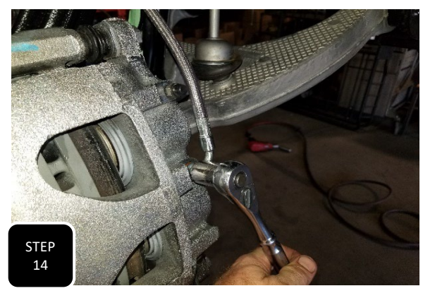
Step 14 Attach the new, extended brake line to the hard line at the frame first and allow fluid to run through the line before attaching it to the brake caliper. Next, attach the brake line to the brake caliper using the factory banjo bolt and the provided copper crush washers. NOTE: THE BRAKE LINE SHOULD BE POINTED STAIGHT UP FROM THE CALIPER.