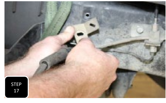
Step 17 Starting with the driver's side, unbolt the mounting bracket closest to the soft line. Next, gentely bend the hard line downward and outward to make room for the new bracket. Lastly, slightly unravel the mounting bracket on the hardline so that it is at about a 30 degree angle.