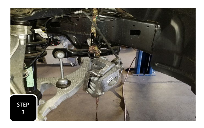
Step 3 Unbolt the brake caliper and support out of the way with a strap. NOTE: NEVER ALLOW THE CALIPER TO HANG FROM THE BRAKE LINE.