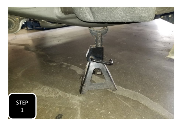
Step 1 Jack up the front of the of the vehicle and support under the frame rails with jack stands. Remove both front tires and proceed with one side at a time.