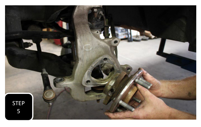
Step 5 Unbolt the 3 wheel bearing mounting bolts and remove the hub assembly. NOTE: THE FACTORY DUST SHIELD WILL NOT GET RE-INSTALLED.