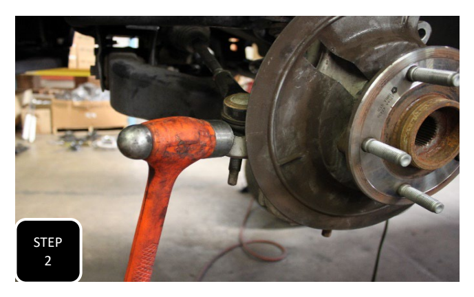
Step 2 Unbolt the nut at the tie rod and break it loose by hitting the spindle with a hammer, right at the tie rod. NOTE: NEVER HIT THE TIE ROD ON THE THREADS.