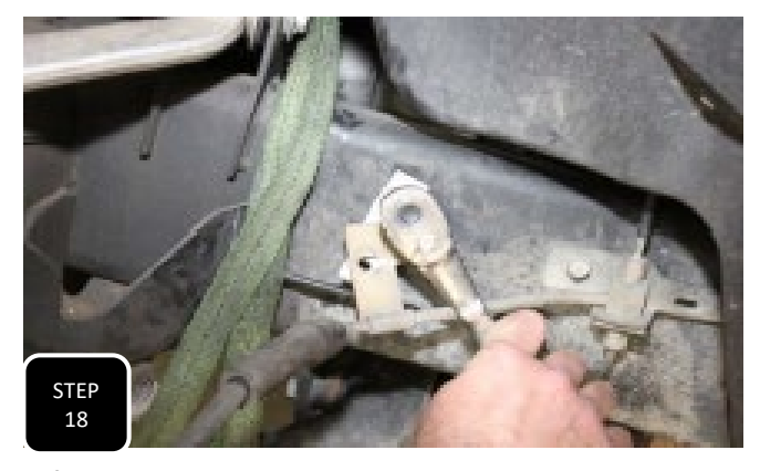
Step 18 Attach the new brake line bracket to the frame using the factory bolt and then to the bracket on the stock hardline using the provided 1/4" hardware and tighten.