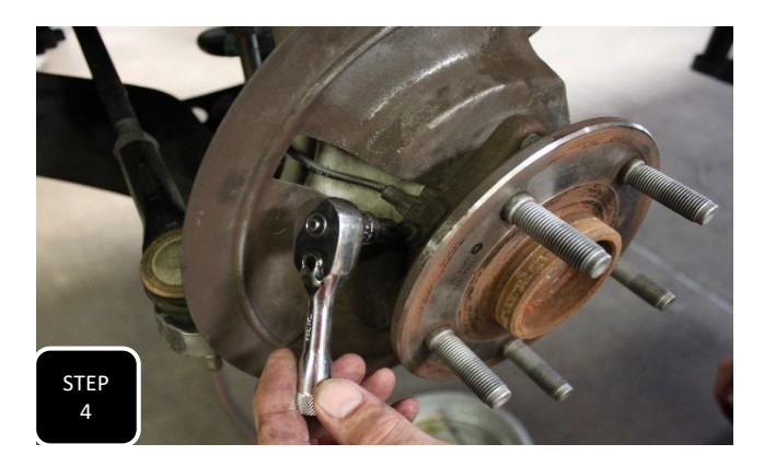
Step 4 Remove the rotor and place it off to the side. Next, unbolt the ABS sensor and swing it safely out of the way so it does not get damaged during the install.