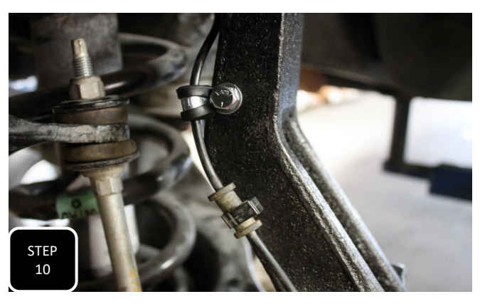
Step 10 Install the ABS sensor using the factory allen bolt. Next, route the ABS line up the neck of the spindle and attach it to the neck of the spindle at one point with the factory plastic clip, and just above that with the provided 1/4" Adel clamp and provided M6 bolt.